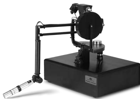
Pantom Premium 1.5/6DOF & 1.5 High Force/6DOF