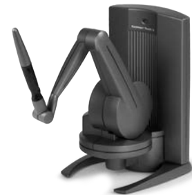
Geomagic® Touch™ X