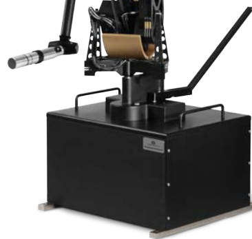
Pantom Premium 3.0/6DOF