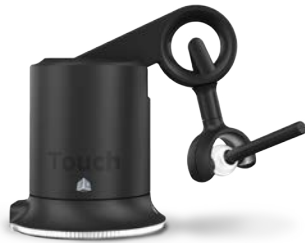
Touch 3D Stylus